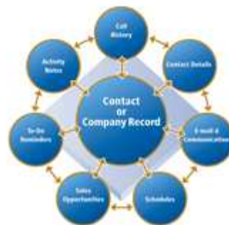
Contact and Customer Manager